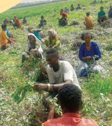
Harvesting of OFSP vines at a DVM farm in Tigray

respect to promotional activities, at least 56,000 people were reached through different nutrition and OFSP promotional activities (cooking demonstrations, school gardens/feeding, nutrition counselling at health posts). 3,200 change agents including extension officers, model farmers and other officials from the bureaus of health and agriculture were trained in various aspects on OFSP agronomy, post-harvest handling, processing, and marketing.