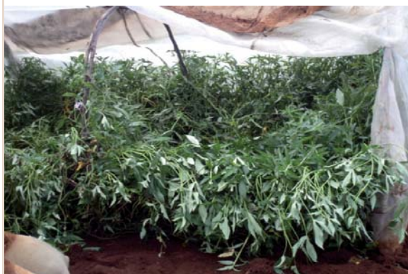
■ Mature clean vines inside net tunnel

Tremendous progress has been made in training national virologists and technicians in virus identification and indexing in Kenya, Mozambique, Ethiopia, and Ghana. Virus survey results from Mozambique and Ghana are now available. We have identified and validated the five most informative simple sequence repeat markers capable of confirming whether two genotypes of African germplasm are the same. Progress towards developing novel diagnostic methods for sweetpotato-virus detection continues to be made and 17 African scientists were trained in these new techniques in January 2012. Using deep sequencing technology, sequences have been determined for several new sweetpotato viruses.