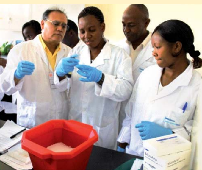
■ Training in DNA extraction for virus detection array

Research breakthroughs to lower the cost of maintaining disease-free planting material and to help farmers in drought-prone areas produce vines for the beginning of the rains may truly help break the bottleneck of timely access to planting material.