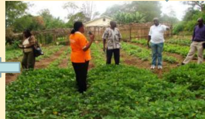
Field multiplication of clean vines