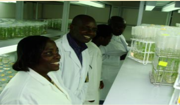
In-vitro plantlets multiplication at Rubona lab (RAB)