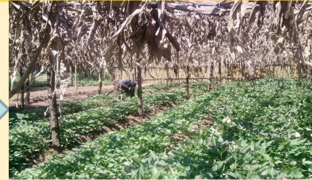
Transfer of plantlets to field