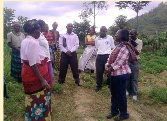
Multiplication at farmers group