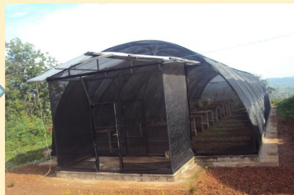
Transfer of plantlets to screenhouse