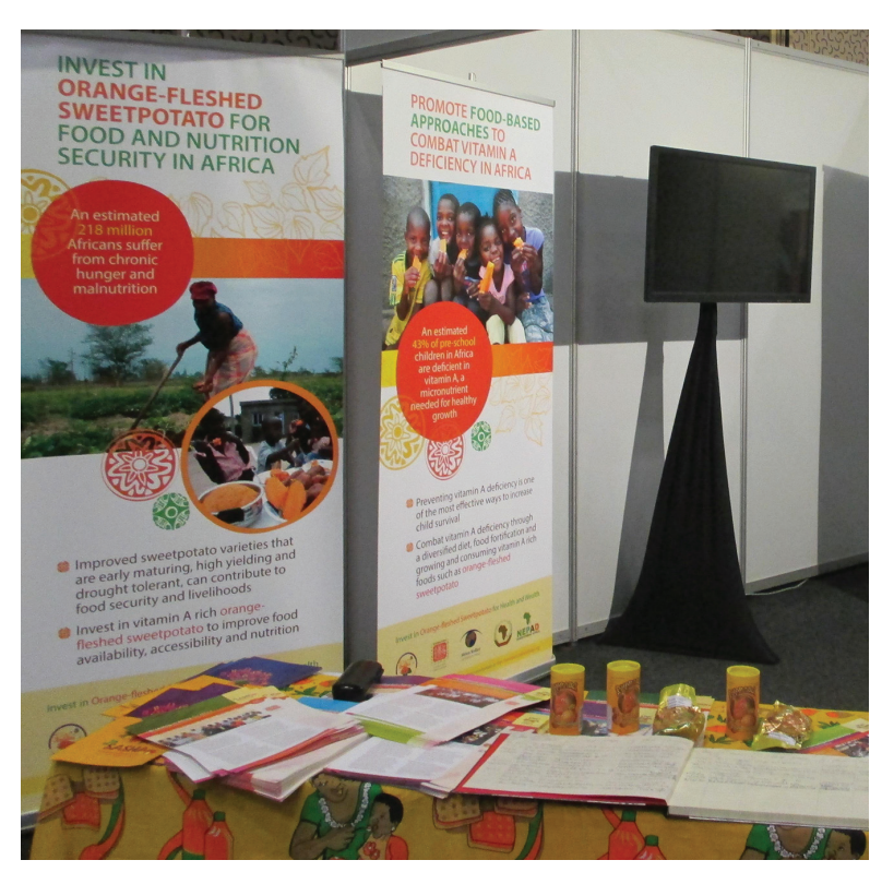
RAC advocacy materials on exhibit at the 10th CAADP Partnership Platform Meeting in Durban, South Africa