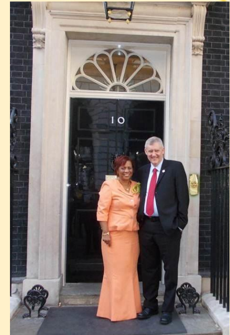
Global Nutrition Event 10 Downing Street 12 th August 2012