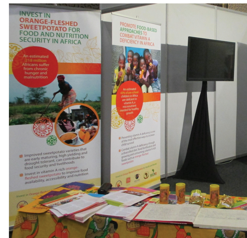
RAC advocacy materials on exhibit at the 10th CAADP Partnership Platform Meeting in Durban, South Africa