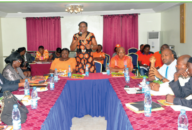
RAC team and stakeholders at a donor round-table meeting in Abuja, Nigeria

The Reaching Agents of Change (RAC) Project advocates for increased investment in orange-fleshed sweetpotato (OFSP) to combat vitamin A deficiency (VAD) among young children and women of reproductive age. RAC also builds institutional capacity to design and implement gender-sensitive projects to ensure wide access and utilization of OFSP in selected African countries. Its efforts contribute to the broader Sweetpotato for Profit and Health Initiative (SPHI), which aims to improve the lives of 10 million African families by 2020. The RAC project (June 2011- December 2014) was implemented in three principal countries: Tanzania, Mozambique and Nigeria and in two secondary countries: Ghana and Burkina Faso. RAC was implemented by International Potato Center (CIP) , which has expertise in OFSP breeding, production, use and promotion; and Helen Keller International (HKI) , an NGO with experience in food-based nutrition and health interventions to combat VAD, and advocacy.