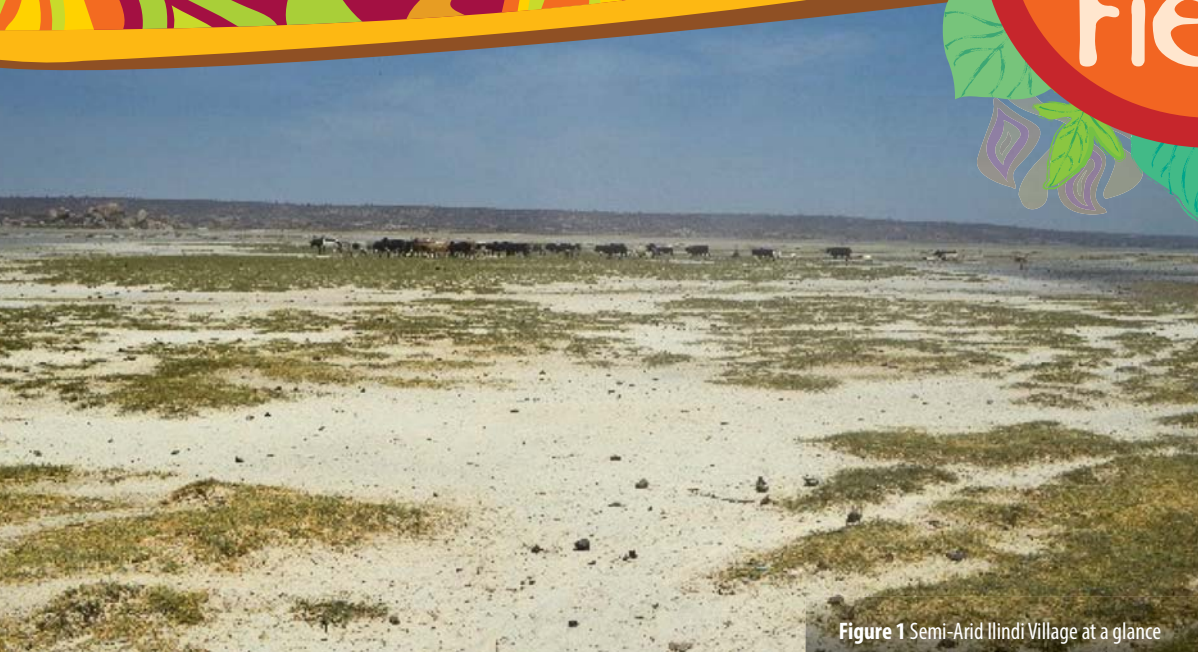
Figure 1 Semi-Arid Ilindi Village at a glance