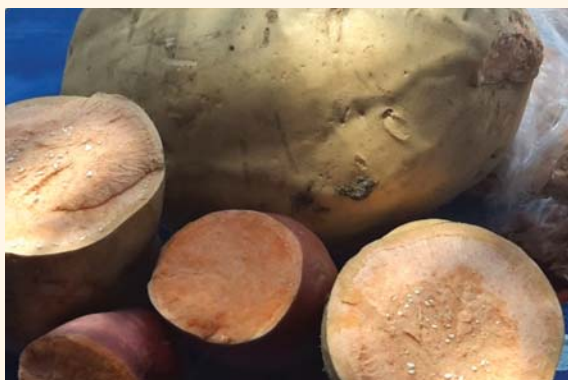
Figure 4 OFSP Varieties grown at Ilindi Village

The 'Ejumula' variety of OFSP is one of the most popular with the Ilindi farmers. It grows impressively in semi-arid conditions and produces gigantic roots (see Figure 4). These roots make the perfect nutritious staple food that is widely consumed at Ilindi.