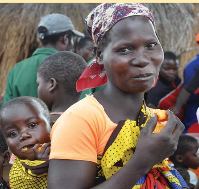
■ Children and their mothers love OFSP

Sweetpotato, with roots that are white or yellow inside, is widely grown in Mozambique. This easy to grow, resilient crop is known as the classic food security crop that is there when the maize fails. Area under sweetpotato has expanded in Mozambique, in part because this crop provides more food (194 MJ) per hectare per day than maize (145 MJ) and cassava (138 MJ). Its short production cycle (3-5 months), ability to grow under marginal conditions and in post-disaster situations, and flexible planting and harvest times, are also driving its expansion.