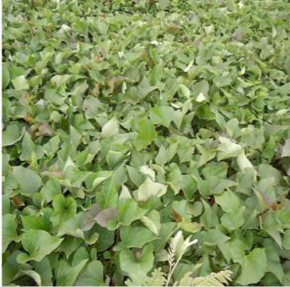
Sweet potatoes Vines