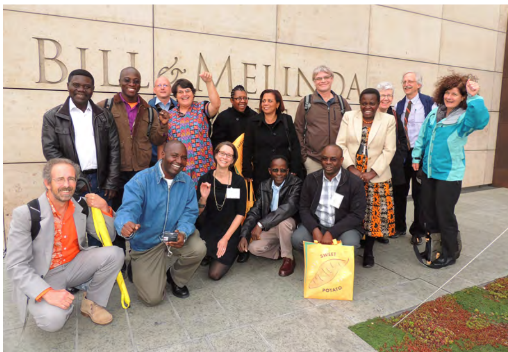
■ The SASHA Senior Management Team and key partners attended a convening at the Bill & Melinda Gates Foundation in March 2013 to review Phase 1 progress and present Phase 2 ideas.

For CIP and the team involved in its strategic objective to reduce malnutrition, it will be essential to monitor, evaluate, learn, and advocate from the research for development program experiences throughout the region, making significant gains in managing partnerships and exchanging information between diverse sweetpotato projects and programs. The experience of Sweetpotato for Profit and Health Initiative (SPHI) as a partnership platform will be model for other crops and other regions. The SPHI CoP will progress in changing the image of sweetpotato from being a poor person's crop to being a healthy food for all.