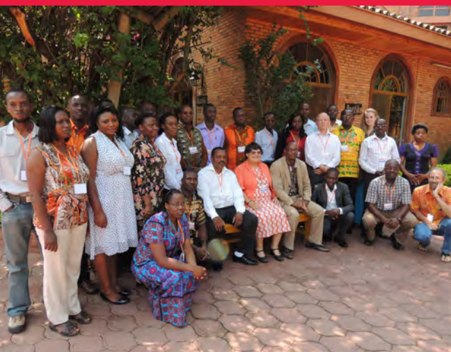
■ Marketing, Processing, and Utilization CoP held first meeting in Kigali