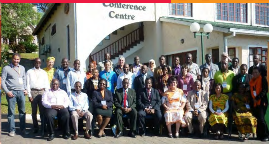
■ Breeders (shown here at annual meeting in 2014) will continue to produce better varieties in Phase 2