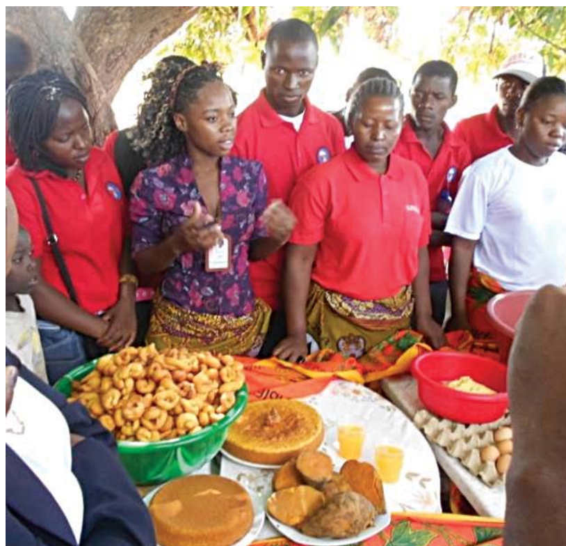
Fig. 4 Improved processing techniques are shown and tasted in culinary demonstrations in Mozambique.

The next step will be to scale up OFSP production and consumption and the EHFP program as a whole to a large number of beneficiaries, in close collaboration with governments and strategic partners in countries where experiences with the program already exist. In other countries, HKI will explore opportunities for extending the program and further increasing the reach of OFSP dissemination. There are also great opportunities to market OFSP as a special food for children and as an ingredient for processed, nutritious foods, with promising experiences from Burkina Faso. OFSP will continue to play a key role in HKI's nutrition sensitive agriculture approach and through past and current field and advocacy activities continues to experience increased demand and recognition.