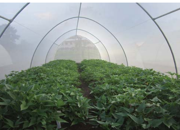
Fig. 2 Vine multiplication tunnel at the national agriculture research center in Cote d'Ivoire.

and consumption of nutrient-rich foods and good nutrition and hygiene practices to poor populations in Africa and Asia through its Enhanced Homestead Food Production (EHFP) program, whose goal is to improve the nutritional status of women and children. Orange-fleshed sweetpotato (OFSP) is an essential part of this program, because it packs record quantities of vitamin A, vitamin C and calories. This makes it a useful power food for women and young children, who are the most vulnerable to malnutrition in general and VAD, in particular. However, OFSP is not always in people's food habits in Africa and people often know and prefer white-fleshed sweetpotato, which does not have the nutritional benefits of OFSP. Thus, the goal is to create demand for OFSP, test and introduce improved varieties (Fig. 2), cultivation, and processing and storage practices. Additionally, HKI aims to build local capacity to disseminate OFSP production and consumption on a large scale (Fig. 3).