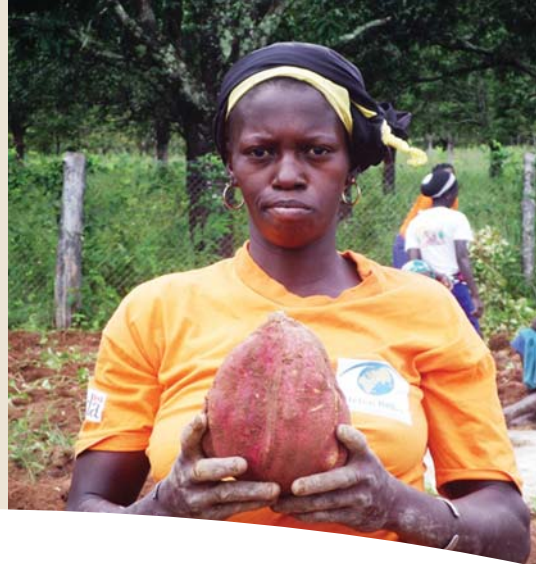
Fig. 1 Beneficiary from Côte d'Ivoire with fresh OFSP root of impressive size.

A multi-sectoral approach is key for large scale dissemination and adoption of orange-fleshed sweetpotato (OFSP) and harnessing its nutritional potential. This requires creating demand for OFSP by communicating the nutritional and agronomic advantages, while at the same time providing training on the cultivation, storage and processing.