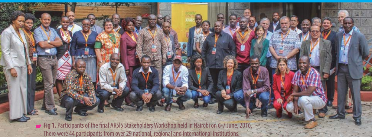
Fig 1. Participants of the final ARSIS Stakeholders Workshop held in Nairobi on 6-7 June, 2016. There were 44 participants from over 29 national, regional and international institutions.