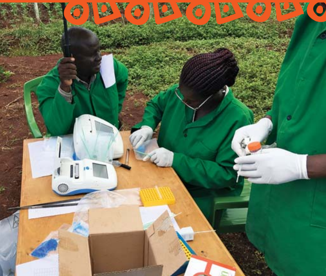
■ Fig 2. Macerating samples in a plastic bag while performing LAMP assay for SPFMV in the field