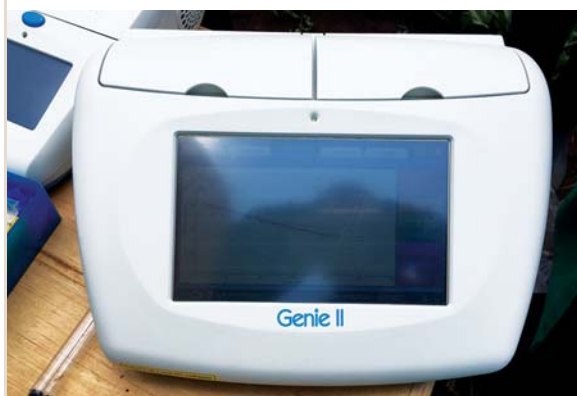
■ Fig. 3 Amplification curve on a Genie II instrument showing detection of SPFMV in 5 minutes.

The sweetpotato virologist from CIP-HQ, made six visits to the SSA region to carry out training in sweetpotato virus testing (indexing) and virus elimination (cleaning). Training on thermotherapy, grafting to indicator plants, NCM-ELISA testing, and PCR testing for sweetpotato leaf curl virus (SPLCV) have been conducted in Kenya, Mozambique and Tanzania. FERA provided two courses, one in the UK and one at Biosciences in eastern and central Africa (BecA) hub Nairobi on the use of LAMP and ClonDiag arrays for virus detection. In addition, the CIP virologist provided a course on RNA extraction and bioinformatics sRSA at Makerere University in Uganda and performed RNA extractions for sRSA with scientists at Kumasi in Ghana, and made several personal training visits to MARI and KEPHIS to support ClonDiag array, LAMP and (real-time) PCR implementation.