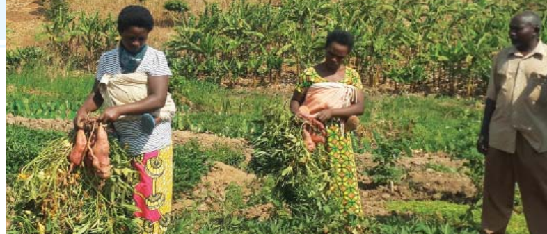
Fig 3. Farmers harvesting demo plot at Kayonza

We distributed over 200 nutrition counseling cards to