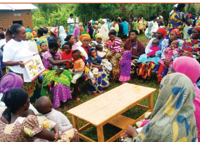
Fig 1. Nutrition training at Kayonza