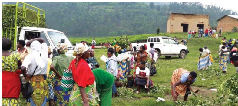
Fig 4. Beneficiaries at Base Gakenke receiving vines

Community Health Workers (CHWs) and Agriculture promoters in the field and are being used. In the same period 101 community-level IYFC events were undertaken, 125 agricultural events and 107 cooking and processing events were undertaken.