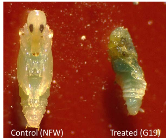
(Left) Normal pupal development. (Right) Dead pupae after 14 days treated with dsRNA against Ribosomal protein s13e (G19)